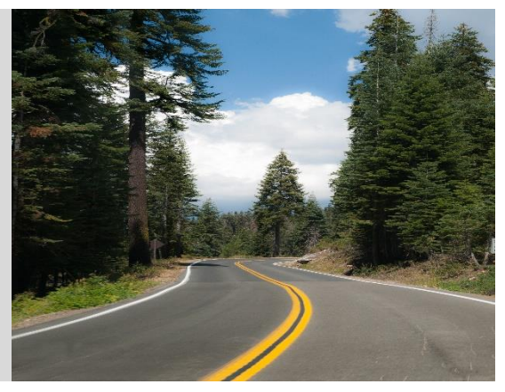
This Photo is licensed under CC BY-SA

This survey will take less than five (5) minutes. Ask questions or provide suggestions. This is YOUR newsletter! Tell us what you want to see.