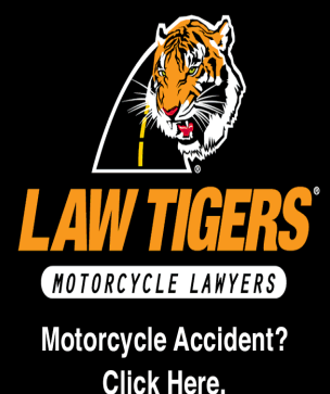
<u>Dallas Motorcycle Lawyers - Law Tigers</u>

Law Tigers is a national association of independent law firms in various states that represent motorcycle riders. This is a paid advertisement for a network (national association) of independent law firms in various states who are members of the American Association of Motorcycle Injury Lawyers.