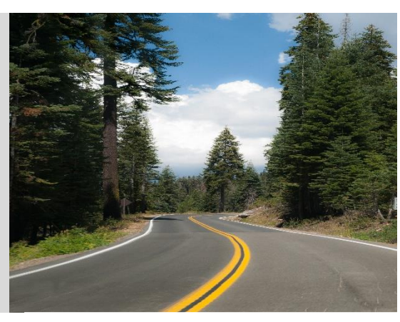
This Photo is licensed under CC BY-SA

Contact us at news@texasabate.com www.texasabate.com