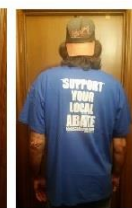
Royal Blue (RB)

Unisex - Port & Company Core Blend White Logo on Front/White Lettering on Back