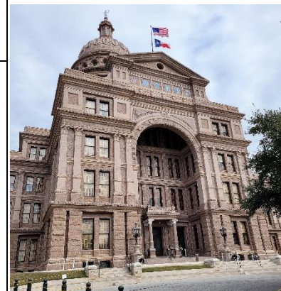
Texas Capitol, 1100 Congress Ave, Austin, Opened April 21, 1888