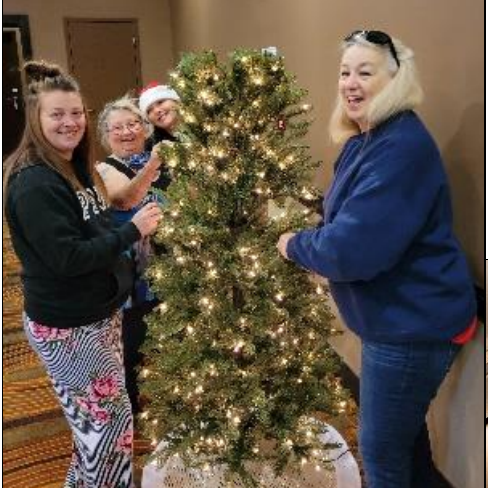
A little prep work and pre-party shenanigans...

It's ALWAYS a great time when you celebrate the with Texoma Abate! If you missed this year's Christmas Party, do yourself a favor and be sure to clear your calendar for the next one... You will not be disappointed!