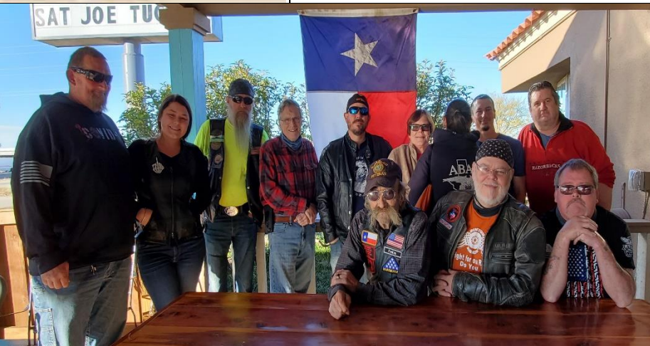
Denton Abate Chapter Meeting