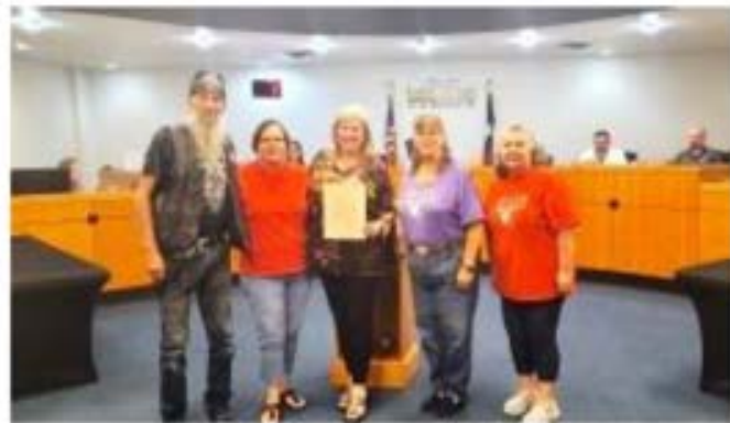
CITY OF LAKE DALLAS, TX (4/25/2024)