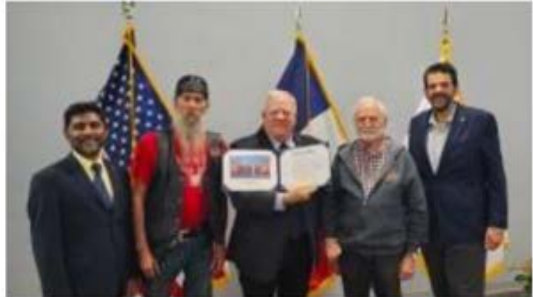
CITY OF RICHARDSON, TX (4/15/2024)