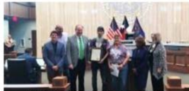
DENTON COUNTY, TX (5/7/2024)