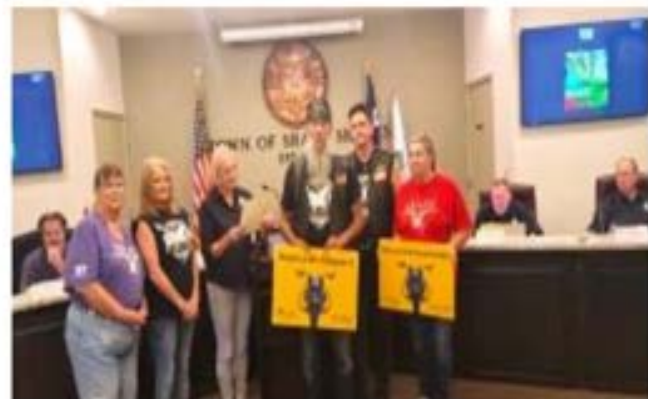
TOWN OF SHADY SHORES, TX (5/13/2024)