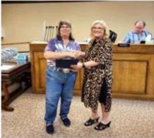
CITY OF KRUM, TX (4/1/2024)