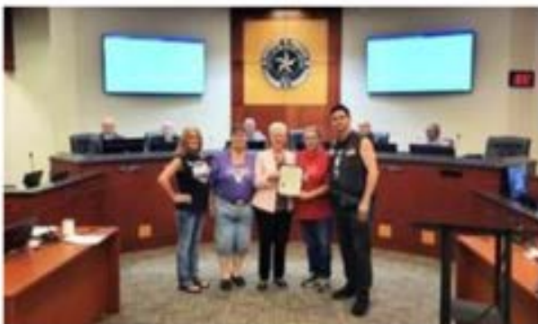
TOWN OF HICKORY CREEK, TX (5/13/2024)