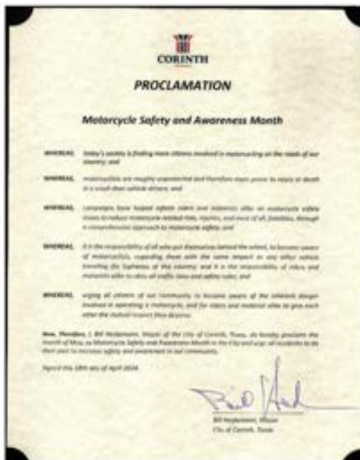
CITY OF CORINTH, TX (4/18/2024)